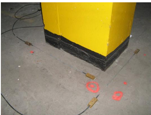
Optical Strand locations to measure longitudinal and transversal deformations of the slab